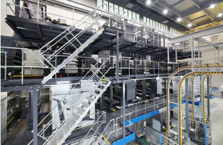
Image 1 shows: COLORMAN e:line by manroland Goss at the new production site of the Hankyung Media Group in Incheon, South Korea.