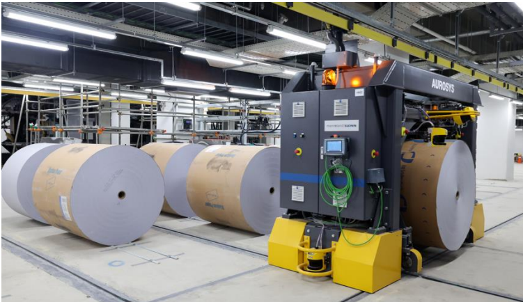
Image 2 shows: Automated paper logistics system AUROSYS at the new production site of the Hankyung Media Group in Incheon, South Korea.