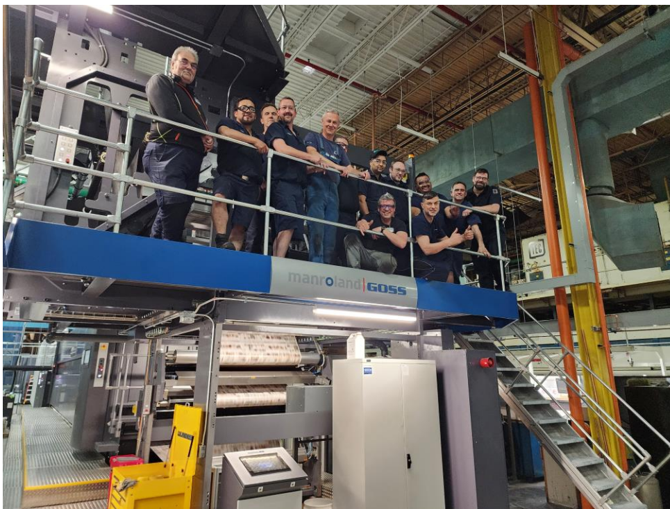
Picture: Technical team from Quad and manroland Goss in front of the new LITHOMAN IV